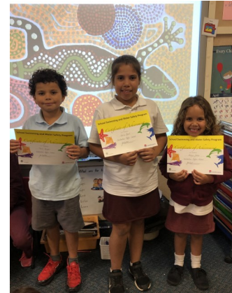
Certificate of Achievement recipients for the School Swimming and Water Saving Program

Could all children please return ALL library books to the school. Thank you.